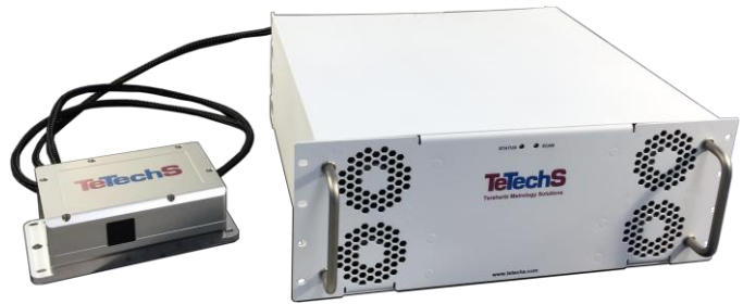
TeraGauge 5000: A compact terahertz measurement gauge

TeTechS' TeraGauge™ is a non-destructive testing measurement gauge powered by terahertz waves. TeraGauge is proven to be perfectly suited for non-contact and precise thickness measurement of opaque and transparent materials such as plastic bottles, preforms, rubber, ceramics, composites, glass, wood, and plastic web and sheet. Specially designed for industrial use, TeraGauge is used by OEMs as an off-line, at-line and in-line measurement gauge. Multi-layer thickness measurement is just one of its many applications and is most pertinent to the plastics manufacturing industry.