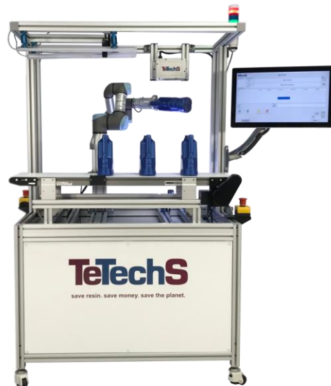
PlastiMeasure 3000: A turnkey thickness measurement solution powered by TeraGauge