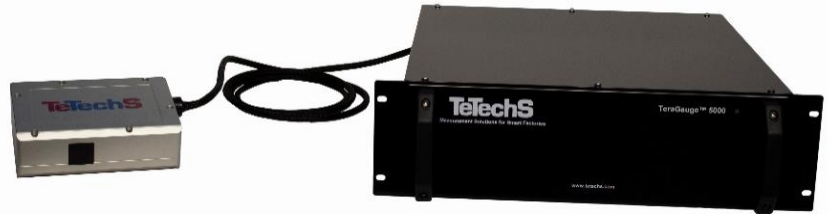
TeraGauge 5000: A compact terahertz measurement gauge

TeTechS' TeraGauge™ is a non-destructive testing measurement gauge powered by terahertz waves. TeraGauge is proven to be perfectly suited for non-contact and precise thickness measurement of opaque and transparent materials such as plastic bottles, preforms, rubber, ceramics, composites, glass, wood, and plastic web and sheet. Specially designed for industrial use, TeraGauge is used by OEMs as an off-line, at-line and in-line measurement gauge. Multi-layer thickness measurement is just one of its many applications and is most pertinent to the plastics manufacturing industry.