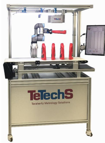
PlastiMeasure 3000: A turnkey thickness measurement solution powered by TeraGauge