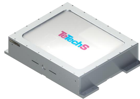
TeraGauge 1000: An all-in-one non-destructive testing measurement gauge powered by terahertz waves