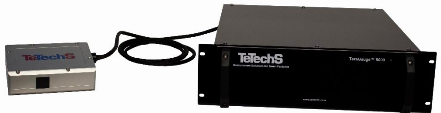
TeraGauge 5000: A compact terahertz powered measurement gauge for in-line applications