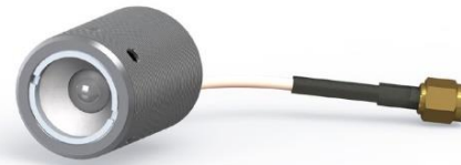
Terahertz Photoconductive Antenna