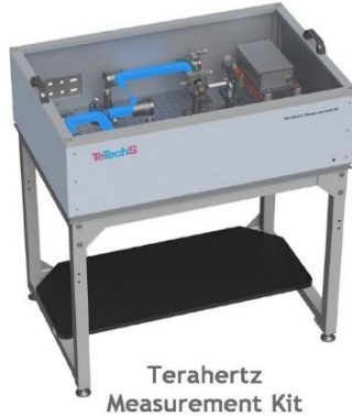
Terahertz Measurement Kit